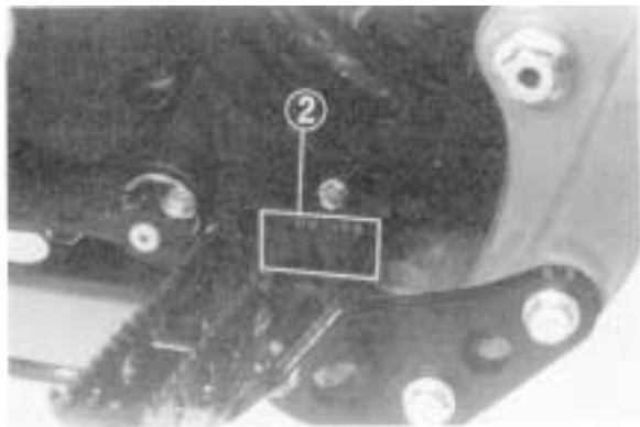
(2) Engine serial number